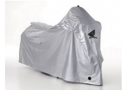
OUTDOOR CYCLE COVER 08P34-BC2-801

A water-resistant and breathable cover that allows your bike to dry whilst covered. Protects the paintwork from UV rays. Supplied with an anti-flutter rope and two security holes.