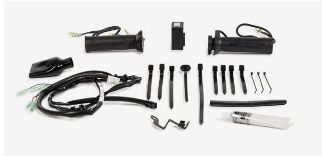
HEATED GRIPS KIT 08ESY-MKN-HG19B

Extremely slim heated grips that provide 360° heat all around them with smart allocation that focuses on the area of the hands most sensitive to cold. Features integrated control for maximum rider comfort and design integration. 3-step variable heating levels are available. An integrated circuit protects the battery from draining. This kit includes the attachment (08E70-MKN-D10) and the special heat-resistant cement (08CRD-HGC-23GHO).