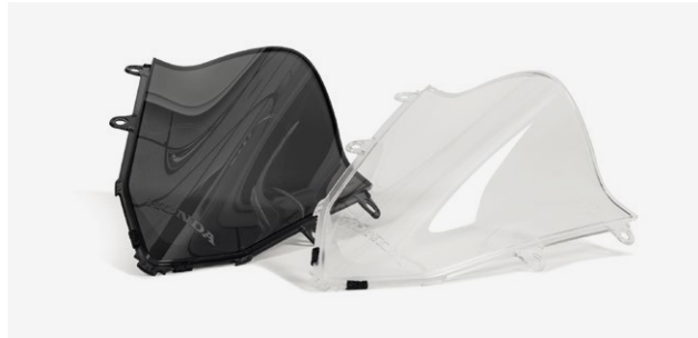
HIGH WIND SCREEN 08R70 or 08R71-MKN-D10

Replacement screens offering additional wind protection without compromising visibility. 2 models available: