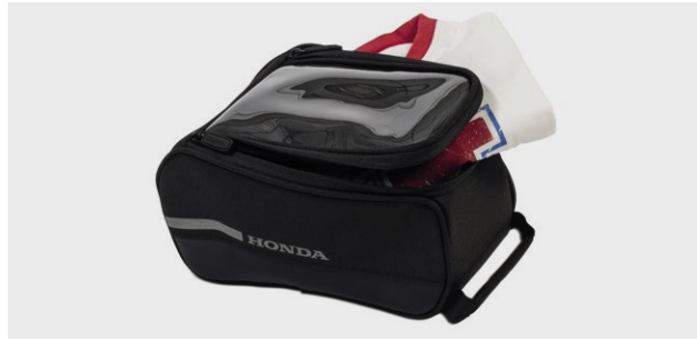
TANK BAG 08ESY-MKJ-TKB18

Functional 3-litre capacity bag fitting the tank. The stable mounting does not disturb the handling of the CBR650. Clear pocket on the top for easy smart phone storage. Rain cover and attachment included.