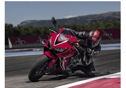
The CBR650R in action.

Since 1999, with the ST1100 Pan European model, Honda have equipped more and more of its motorcycles with a system called Honda Selectable Torque Control (HSTC). This system constantly monitors the speeds of the front and rear wheels via speed sensors incorporated into the Anti-Lock Braking System (ABS). When the rear wheel begins to rotate significantly faster than the front, the systems reduces fuel delivery to the engine, limiting rear-wheel slippage. In 2019 with the new CBR650R, Honda applied this technology to its mid-displacement Supersport motorcycle for the first time. The rider can deactivate it on demand.