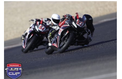
The CBR500R Cup.

It's not rare to find some CB500 proudly boasting more than 300,000 km (more than 186,000 miles), but the long-time favourite of the couriers and the driving school is much more than a workhorse. Beginning in France in 1996, the CB500 Cup spread across Europe quickly. Since 2014, it is on CBR500R that young talents try to make a name by themselves, on a budget. Sebastien Charpentier or James Toseland, to name a few, started there.