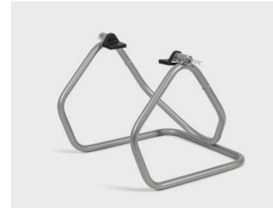
REAR MAINTENANCE STAND 08M50-MW0-801

Extremely slim heated grips that provide 360° heat all around them with smart allocation that focuses on the area of the hands most sensitive to cold. Features integrated control for maximum rider comfort and design integration. 3-step variable heating levels are available. An integrated circuit protects the battery from draining. This kit includes the attachment (08E70-MKN-D10) and the special heat-resistant cement (08CRD-HGC-23GHO).