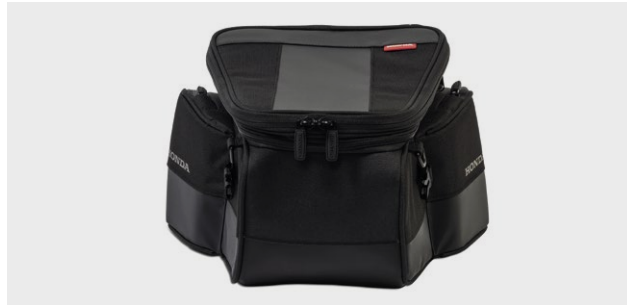
REAR SEAT BAG 08ESY-MKJ-STB18

Dimensions in mm (W x L x H): 178 x 285 x 130.