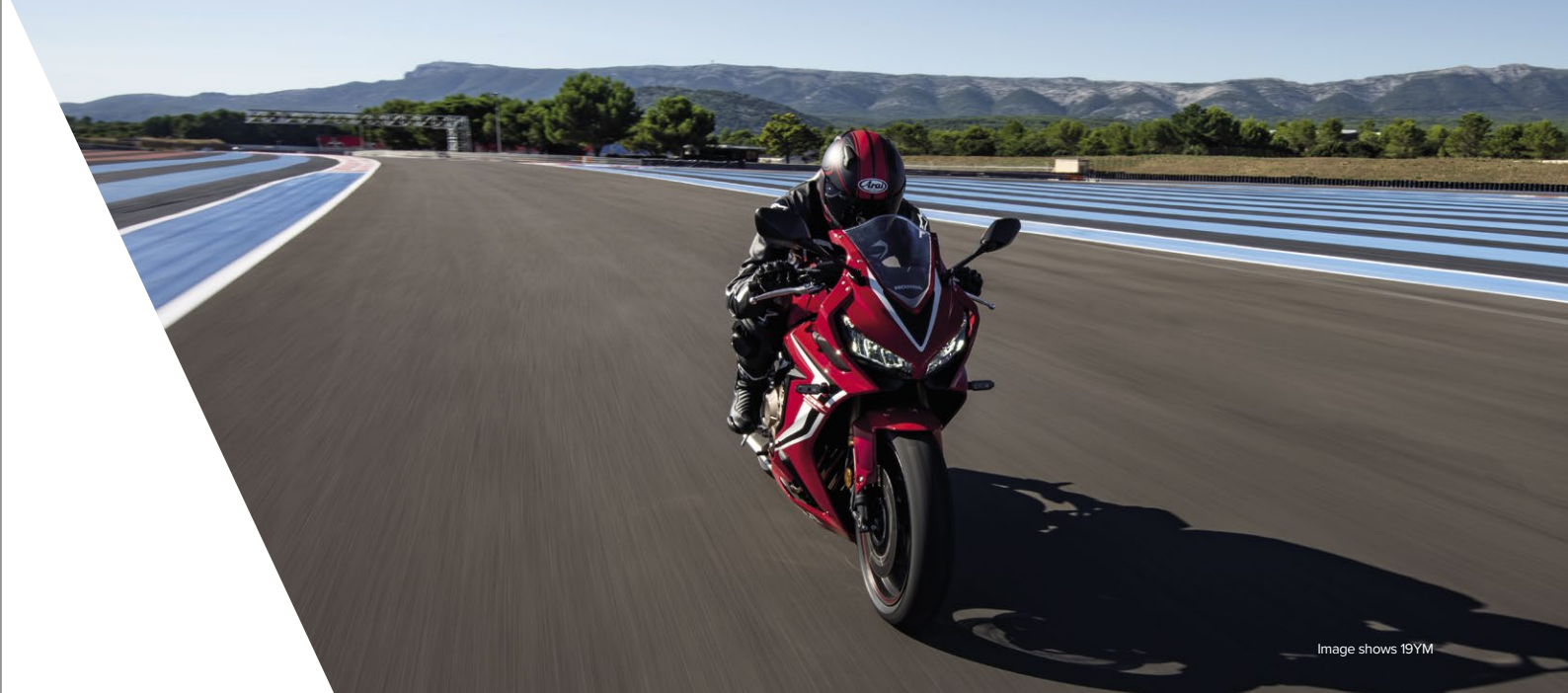
Image shows 19YM

Dimensions in mm (W x L x H): 355 x 365 x 243.