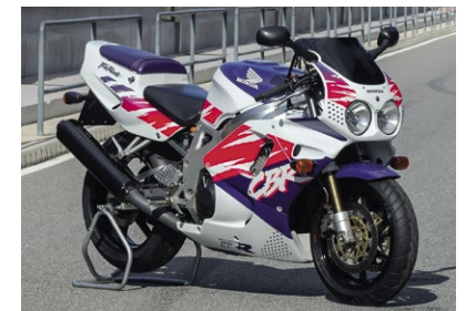
The CBR900RR Fireblade that started it all.

Aiming to create a high-performance motorcycle that could defeat its own RVF750 in Endurance Road Races, Honda developed an R&D project that led directly to the CBR900RR, in 1992. With 128 HP, it was not the most powerful of its time. However, thanks to a dry weight of 185 kg when all rivals were well over 200 kg, the first Fireblade, soon nicknamed "Blade" by the fans, was so easy to control that it seemed to read its rider's mind. More than 25 years after, the most powerful and nimble Honda bikes keep carrying the Blade legacy.