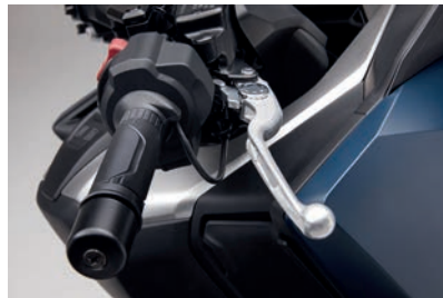
HEATED GRIPS 08T71-MKT-D00

The 5 temperature levels of these slim heated grips are displayed on the TFT monitor when in use. When the ignition is switched off, the last position is memorised. An integrated circuit protects the battery from draining.