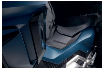
UPPER DEFLECTOR 08R72-MKV-D00

The 5 temperature levels of these slim heated grips are displayed on the TFT monitor when in use. When the ignition is switched off, the last position is memorised. An integrated circuit protects the battery from draining.