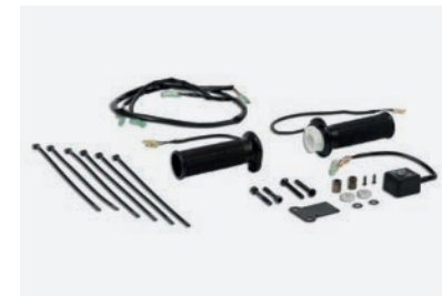
HEATED GRIPS KIT 08ESY-K1Z-GRIP Extremely slim heated grips with integrated control to maximise rider comfort. Features 3 variable heating levels and an integrated circuit to protect the battery from draining. The Kit contains the Grip Heaters, Attachment and heat-resistant glue.