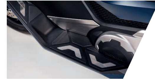
FLOOR PANELS 08P70-MKV-D00

Stainless steel covers to protect body panels from scuffs or kick damage while improving the quality feel of your Forza 750.