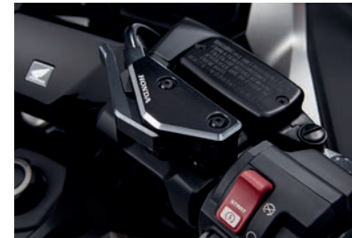
PARKING LEVER COVER 08F72-MKT-D00

Featuring the Forza logo, the Lower Deflectors set improves comfort by reducing the airflow around the rider's knees.