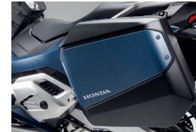
COLOUR-MATCHED PANNIER PANELS 08L81-MKT-D00ZE, F, G or H

With the same anodised black treatment as the cover, this Aluminium Parking Lever adds a premium finish to your Forza 750.