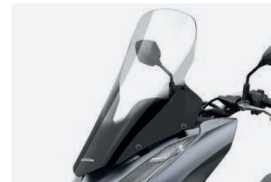
WINDSCREEN 08R70-K1Y-D10 The Windscreen improves rider comfort and protection from the elements.