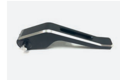
PARKING LEVER 08F70-MKT-D00

With its Anodised Black treatment and Honda logo, this Aluminium Parking Lever Cover will make your scooter stand out.