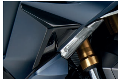
LOWER DEFLECTOR 08R71-MKV-D00

Featuring the Forza logo, the Upper Deflectors set improves comfort by reducing the airflow around the rider's waist.