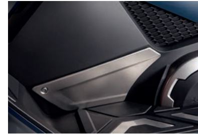
LATERAL COVERS 08F71-MKV-D00

Stainless steel covers to protect body panels from scuffs or kick damage while improving the quality feel of your Forza 750.