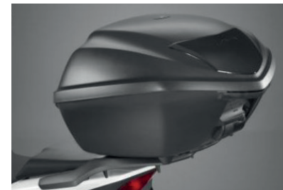
35L TOP BOX KIT 08ESY-K1Z-35TB 35 litre plastic Top Box with the Backrest, Top box base and key system included.